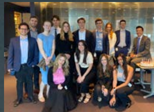
Students gathered to celebrate a colleague's birthday.