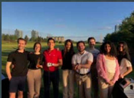
Our 2022 mentor-mentee event.