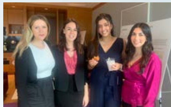
The 2022 edition of the Women Lawyers' Network's Summer Breakfast.