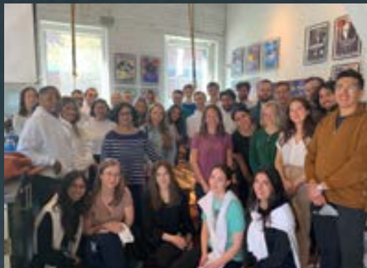
2022 summer kickoff event.