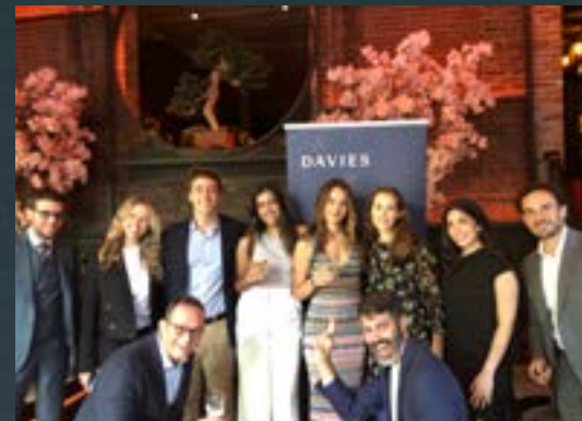
Our annual Summer Dinner.