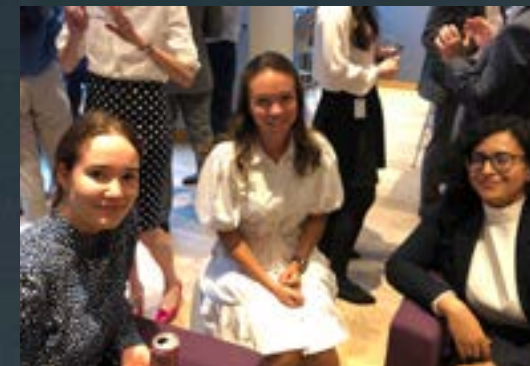
The 2022 end-of-summer cocktail.