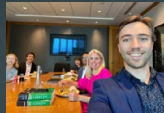
Students and stagiaries are invited to attend our regular practice group meetings.

"A crucial aspect of a law student or a young lawyer's development is mentorship. While on secondment, I continued to meet with my mentor regularly to discuss my career goals, my work, and my mentor's practice as a real estate partner.